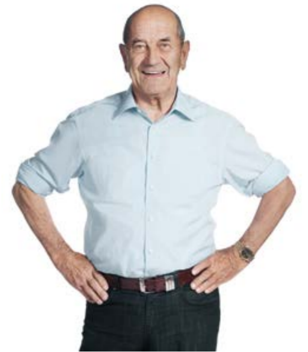
Erwin Hymer (* 27 July 1930; † 11 April 2013), a leading figure of the European caravan and motorhome sector

For decades, Erwin Hymer's inventiveness and ceaseless creativity has shaped the entire industry. His whole life's work provides us with a model for future corporate decisions.