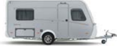
Nova Light 425